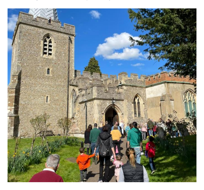
Figure 3 Easter Saturday families fun day